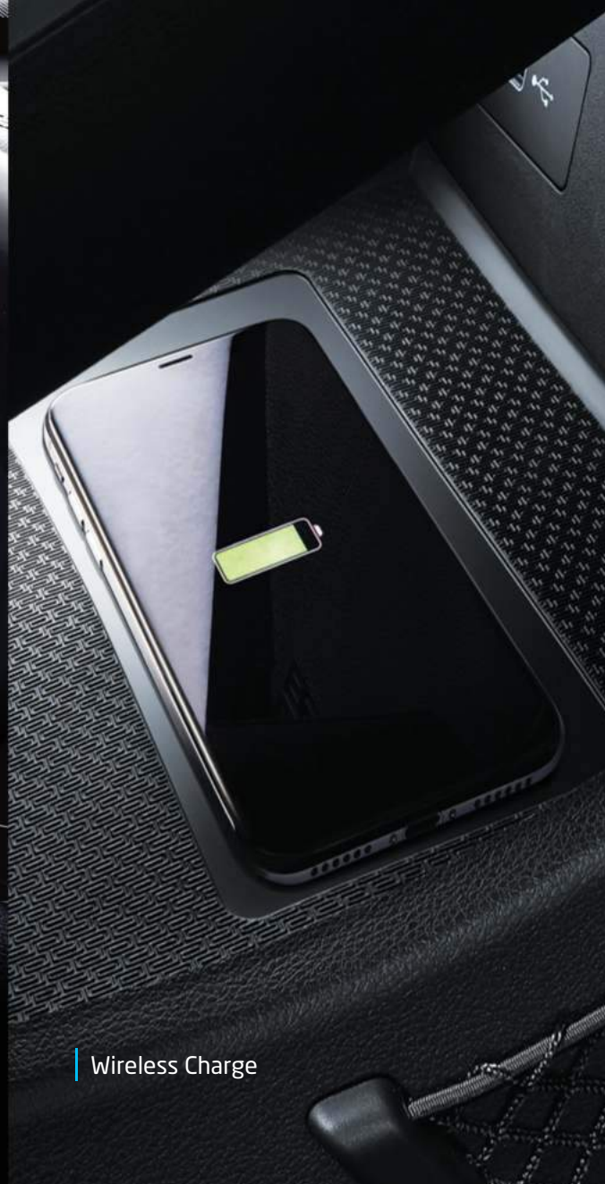
| Wireless Charge