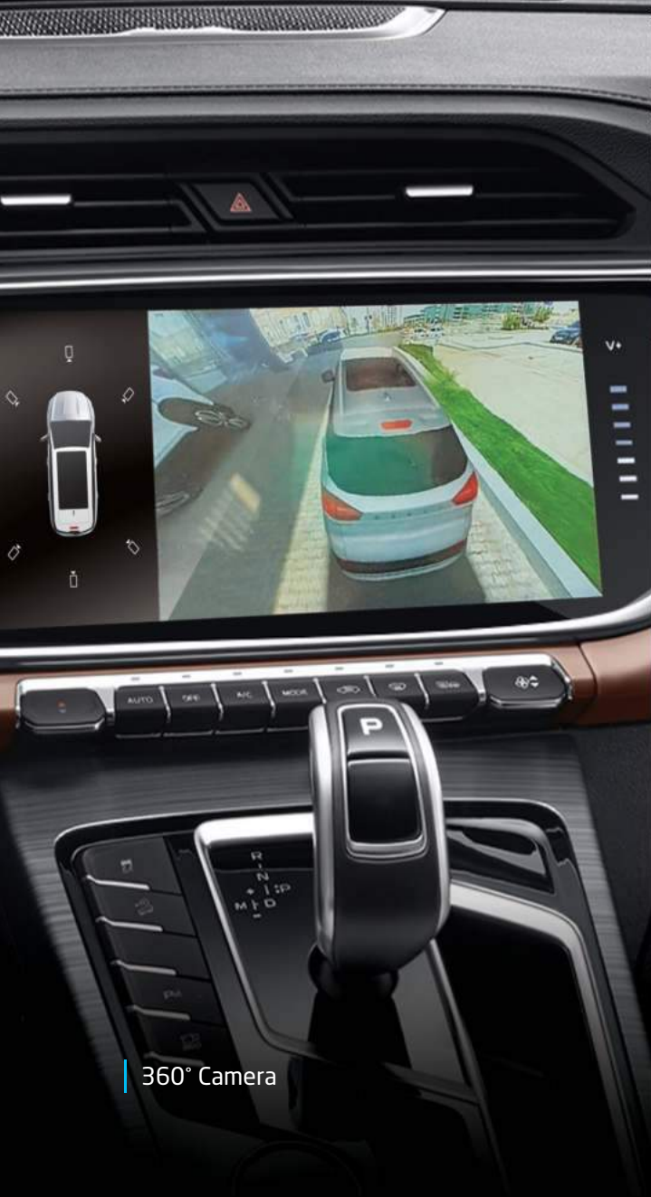
| 360° Camera