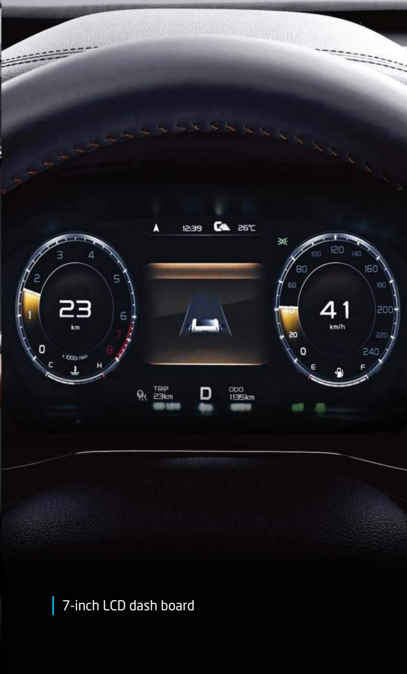
| 7-inch LCD dash board