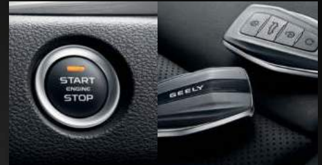
Passive Start/One Button Start