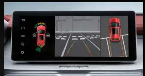
360° Camera /10.25" LCD Screen

High performance provides excellent driving dynamics