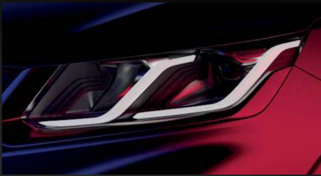
LED headlights including daytime running light